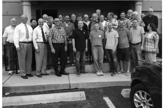
Pictured are individuals who attended the Western Regional Conference.