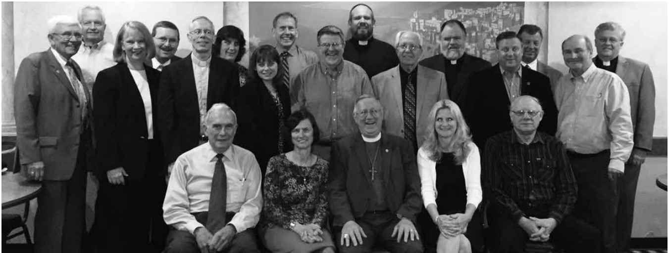
Pictured are members of the English District Board of Directors with Synod Vice Presidents.