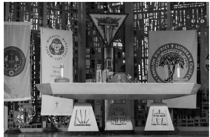
Joyful Divine Services were held in the Concordia University Chapel of the Holy Trinity.

Thank you to everyone who attended the English District’s 55 th Convention. A lot of work goes into planning and logistics, but it is the dedication of the delegates who take the time away from their daily lives to come together, listen, pray and vote that allows the English District to continue its ministry.