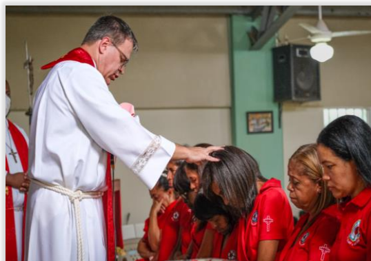
Consecration of 10 deaconesses in the Dominican Republic