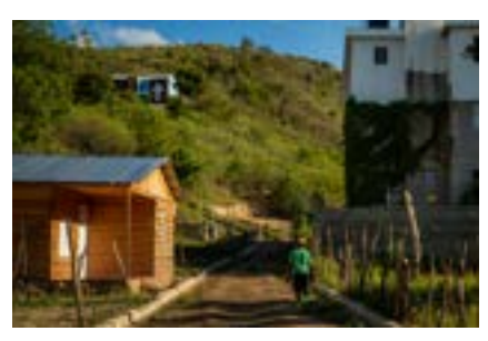
Seminary dormitory with cross on hill