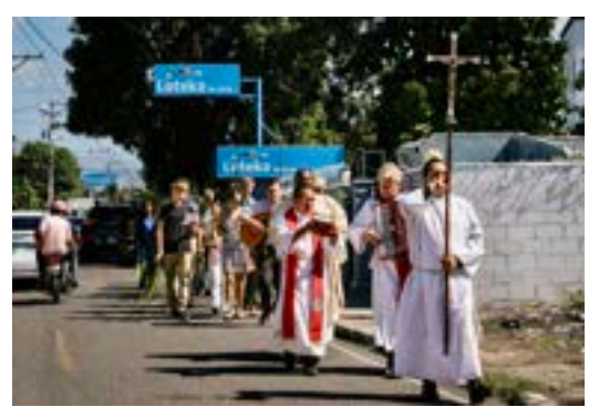
Palm Sunday procession to Lamb of God mission in Licay