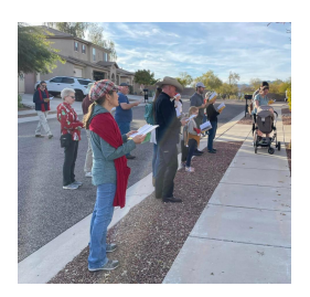
Members of <u>Catalina</u> Lutheran Church, Tucson, AZ, caroling

You could also consider caroling if your local community has a festival or in your local nursing home. Check out Concordia Publishing House's handy <u>Hymns & Carols for</u>